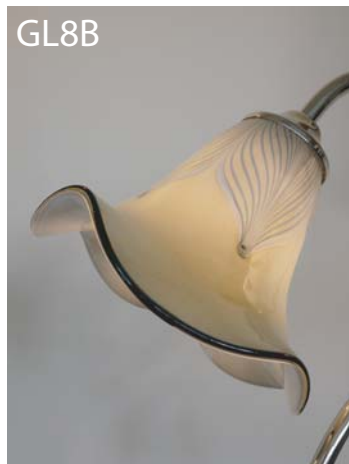
August 2012 Batch - lit