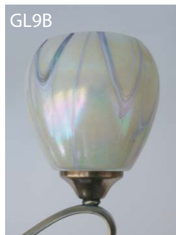
Original Batch - unlit