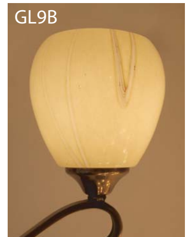
August 2012 Batch - lit