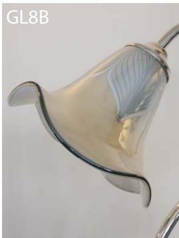
August 2012 Batch - unlit

The latest batches of GL8B & GL9B have finally arrived. We know many of you have been waiting for some time. After inspection we have found that the colours in these batches are more muted than the original batch of Art Glass. Please be aware that this affects the whole of the batch. (However glasses from this batch do have a close match to each other.) Due to the long lead times we have decided to offer these glasses for sale but would like to make you aware of this colour difference. Please see the below images.