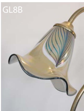
Original Batch - unlit