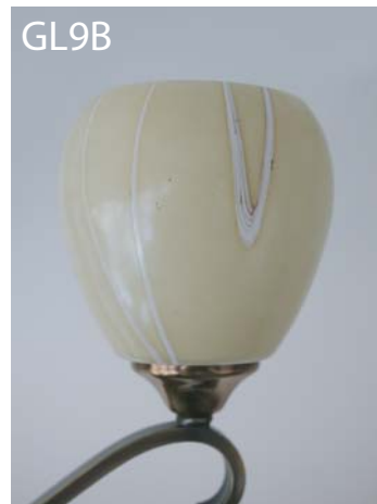
August 2012 Batch - unlit