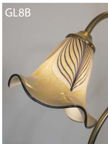
Original Batch - lit